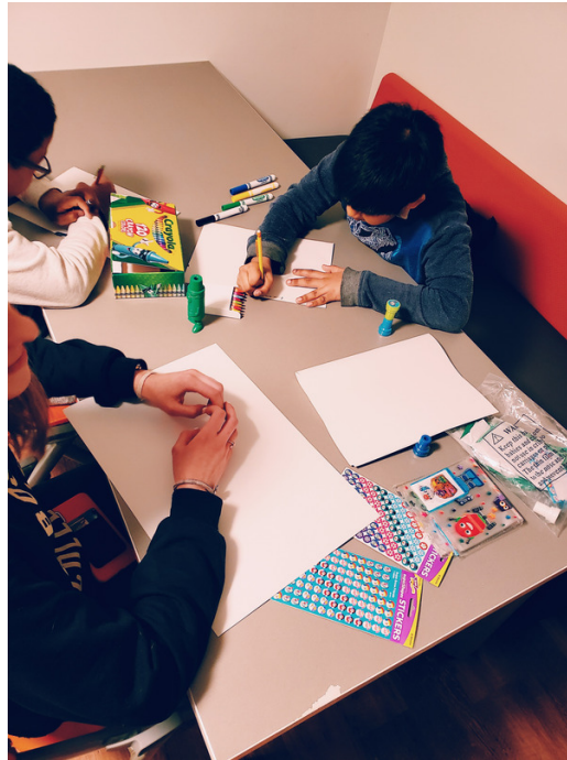
Crafts w/ BC Tutors